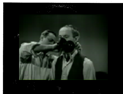
Respirator fit testing, 1930s

Most clips are taken from old government and industrial films from 1916 to 2000, and are in the public domain. The clips range in length from 20 seconds to 10 minutes. A keyword search tool is available on the channel homepage.